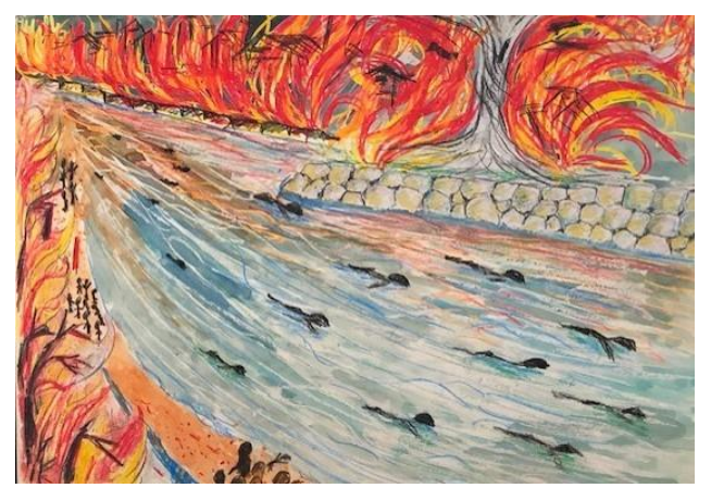
Drawing by Hiroshima bombing survivor. Photo taken by the author at the Hiroshima Peace Memorial Museum, August 2019.

from other survivors of nuclear explosions, those who lived and worked adjacent to testing sites in Algeria, French Polynesia, Australia, the United States, France, the Republic of the Marshall Islands, Western China, and Kazakhstan. There are individuals from each of these locations still suffering from the aftereffects of their experiences with nuclear weapons.