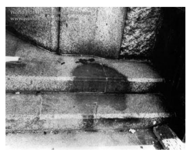
United States Strategic Bombing Survey photo of the steps of Sumitomo Hiroshima Bank, Kamiya-Cho, 850 feet (260 meters) from the hypocenter – United States National Archives.